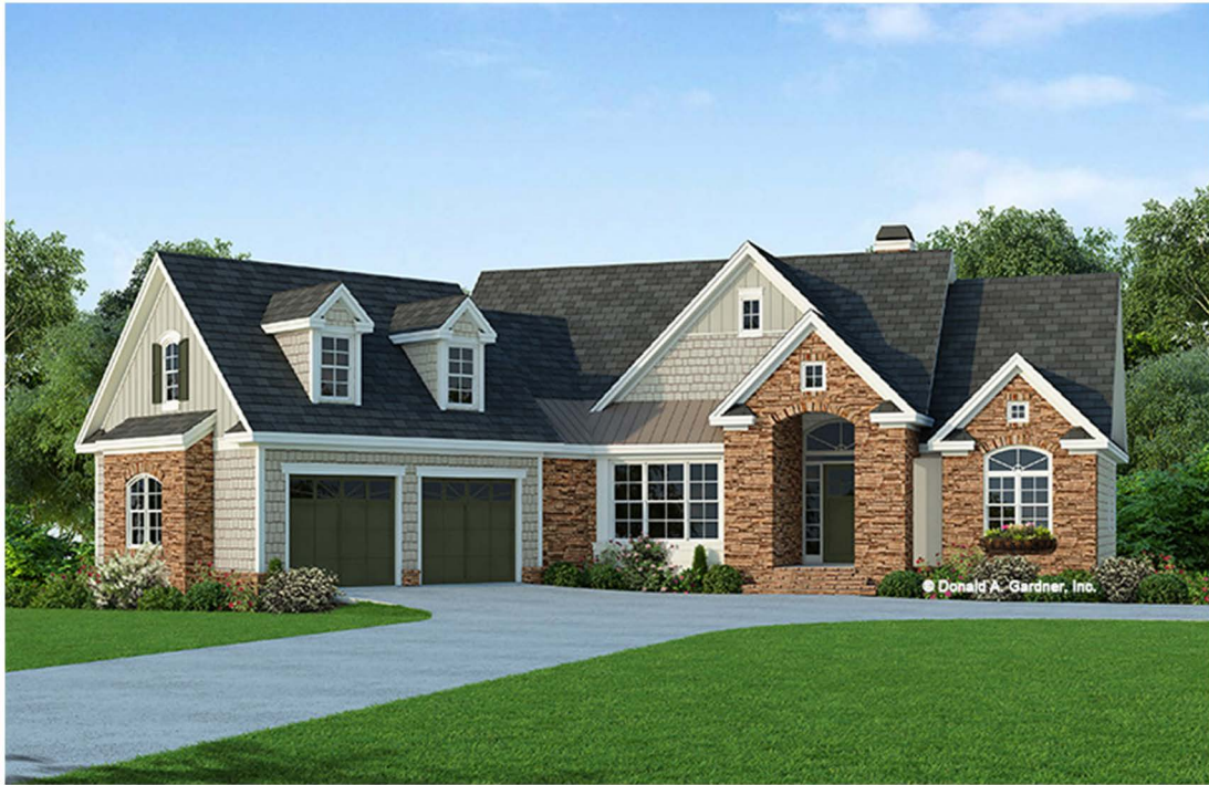
FLOOR PLAN PLAN NO. 1254 D