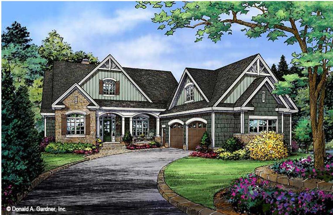
FLOOR PLAN PLAN NO. 1338 D