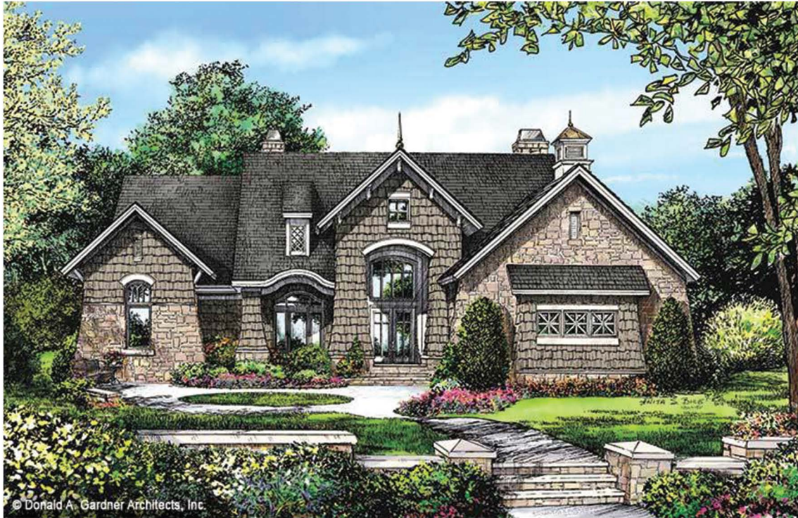
FLOOR PLAN PLAN NO. 1368