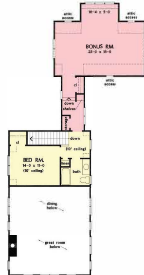
FLOOR PLAN PLAN NO. 1638

SECOND LEVEL SF - 314 OPTIONAL BONUS ROOM SF - 558